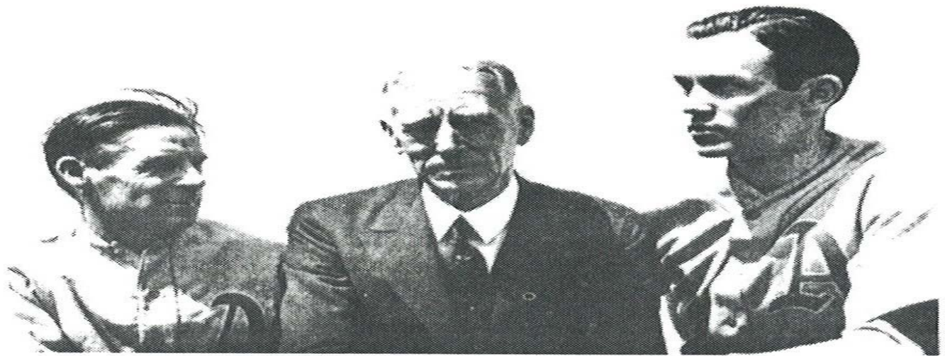
The Grand-Old-Man of Baseball with his two sons looking over team at spring training.