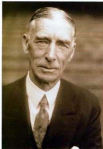
A Great Champion, A Great man, A Great Spirit