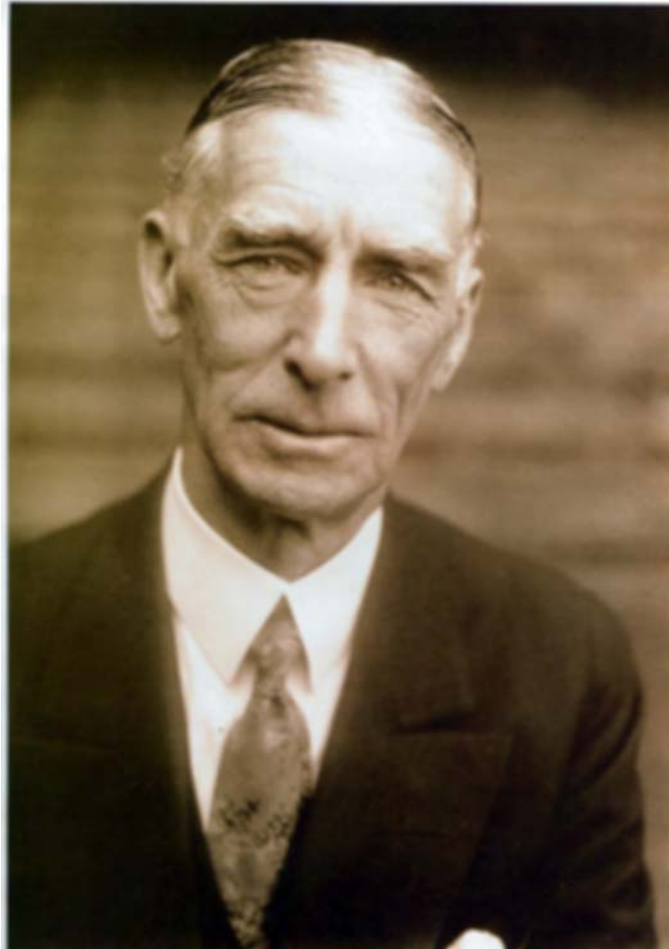
A Great Champion, A Great Man, A Great Spirit